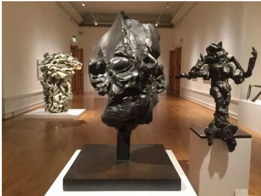
From left to right: Archaic Stooge by John Chamberlain, Head III and Hostess, both 1973, by Willem de Kooning