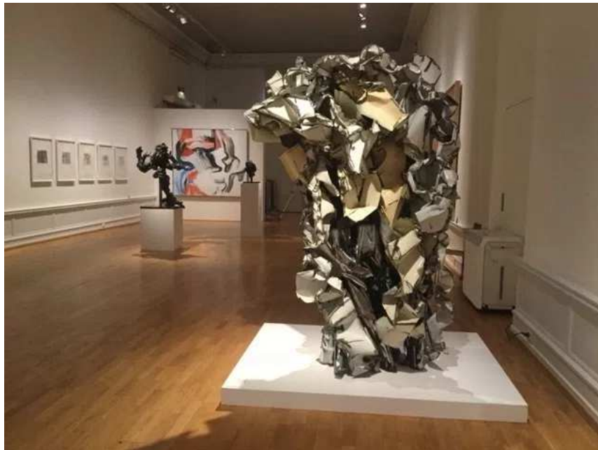
Archaic Stooge (1991) by John Chamberlain