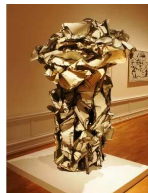
Archair Stoooge, by John Chamberlain. Painted and chromplated steel